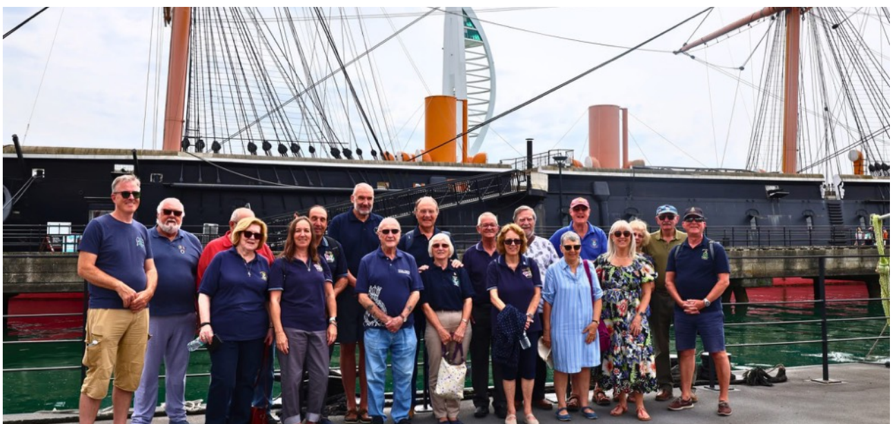
Shipmates prior to boarding MV Netley for a Grand Harbour Cruise