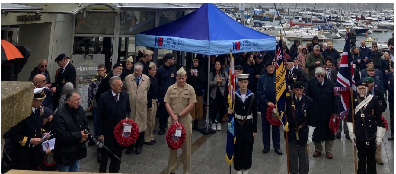
During the memorial service