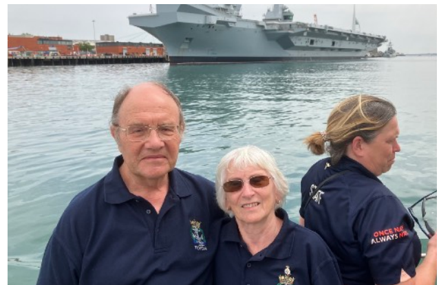
During our 'Sea Time' in Pompey Harbour