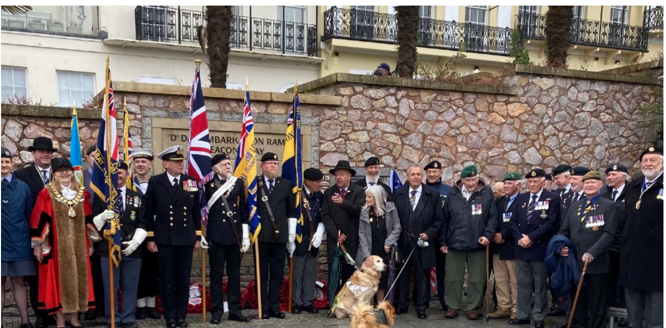
Veterans and dignitaries after the service