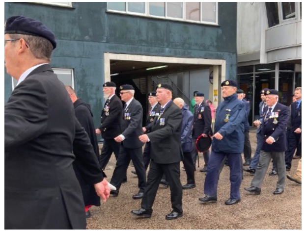
Torbay RNA members in the parade