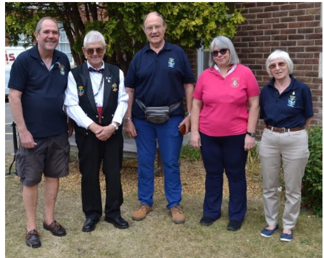
With Shipmates from Lee-on-the-Solent & Stubbington Branch