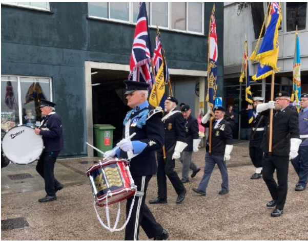
Drummers kept everyone in step!