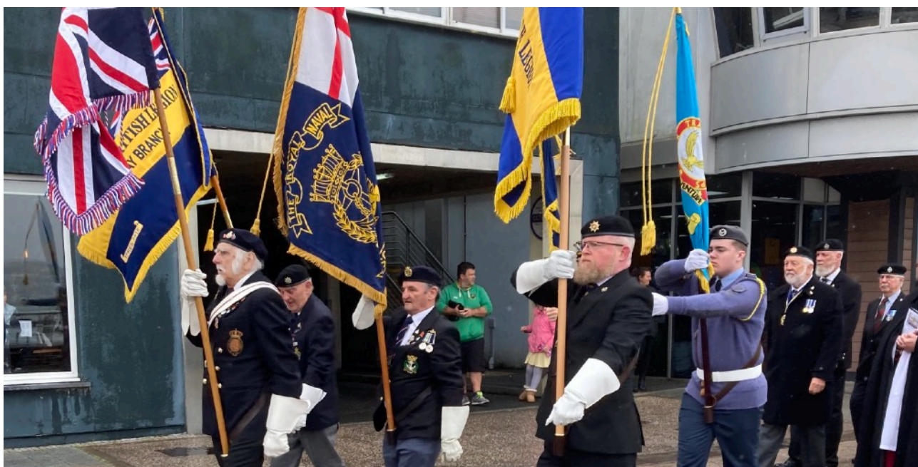
Branch Standards leading the parade prior to the memorial service

Originally organised by local personnel who served in the D-Day landings of 1944, this annual event has been maintained by the Torquay Royal British Legion.